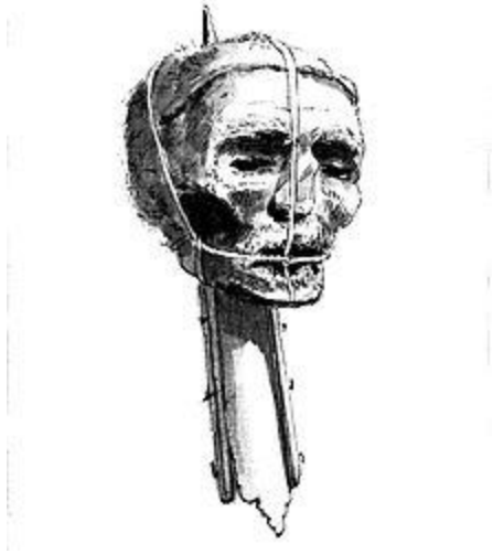
A drawing of Oliver Cromwell's head on a spike from the late 18th